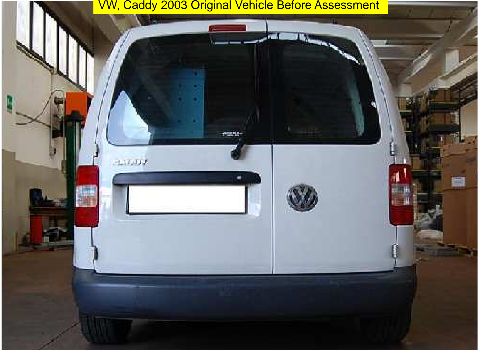
VW, Caddy 2003 Original Vehicle Before Assessment