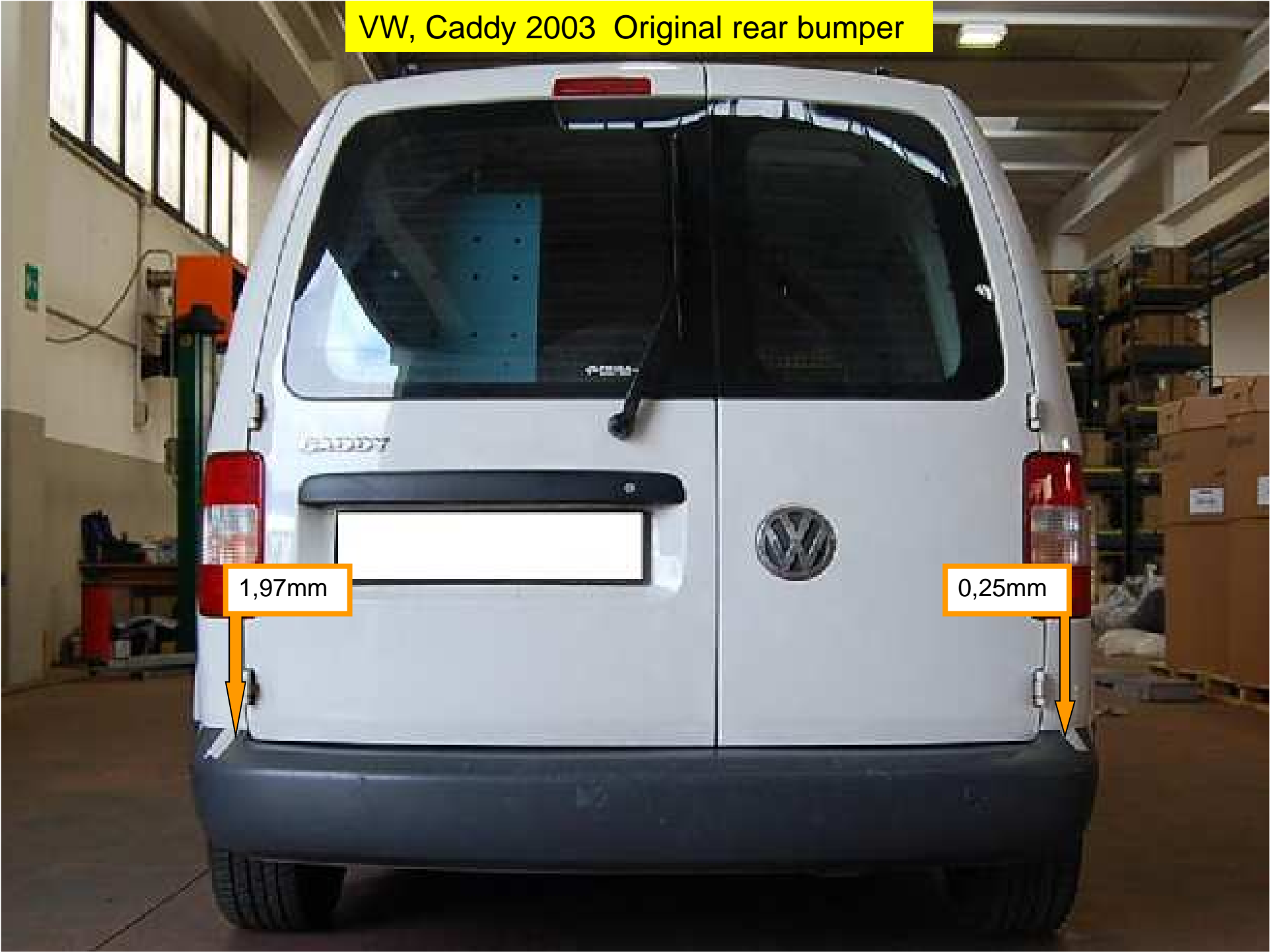
VW, Caddy 2003 Original rear bumper