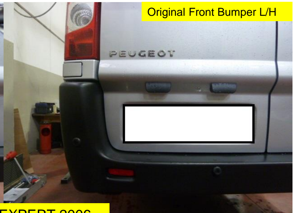
PEUGEOT EXPERT 2006