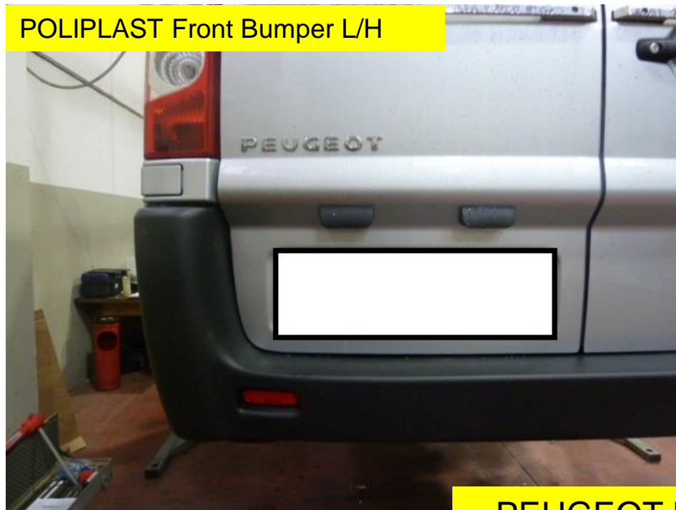
POLIPLAST Front Bumper L/H