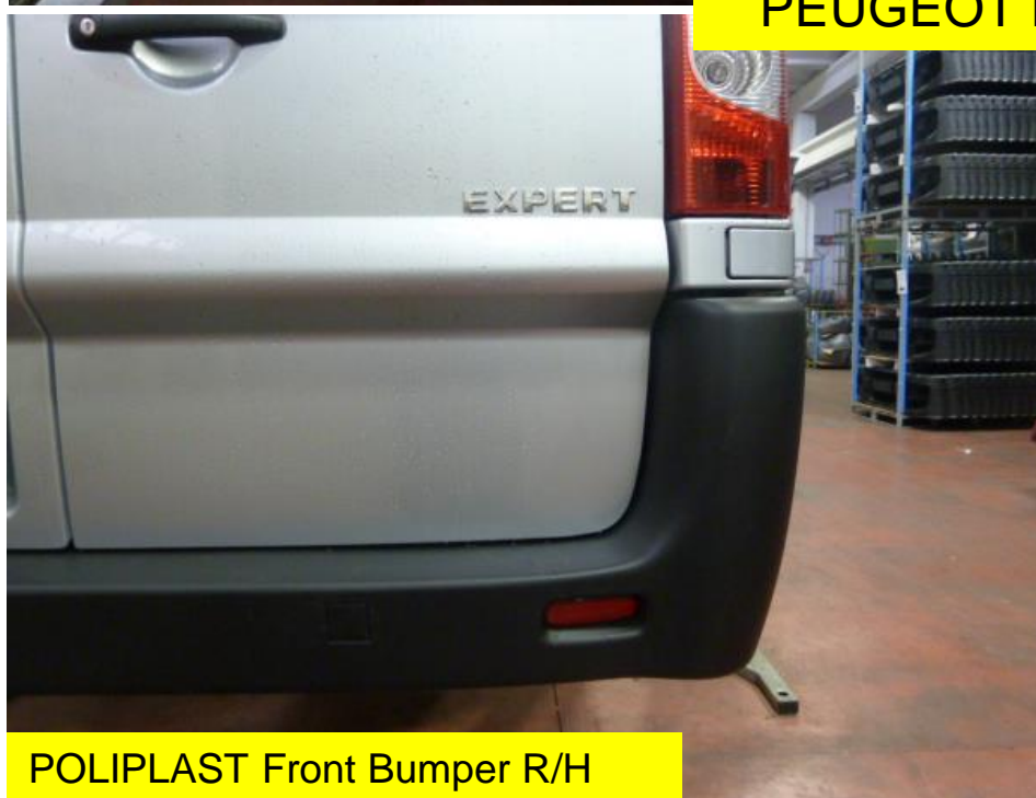
POLIPLAST Front Bumper R/H