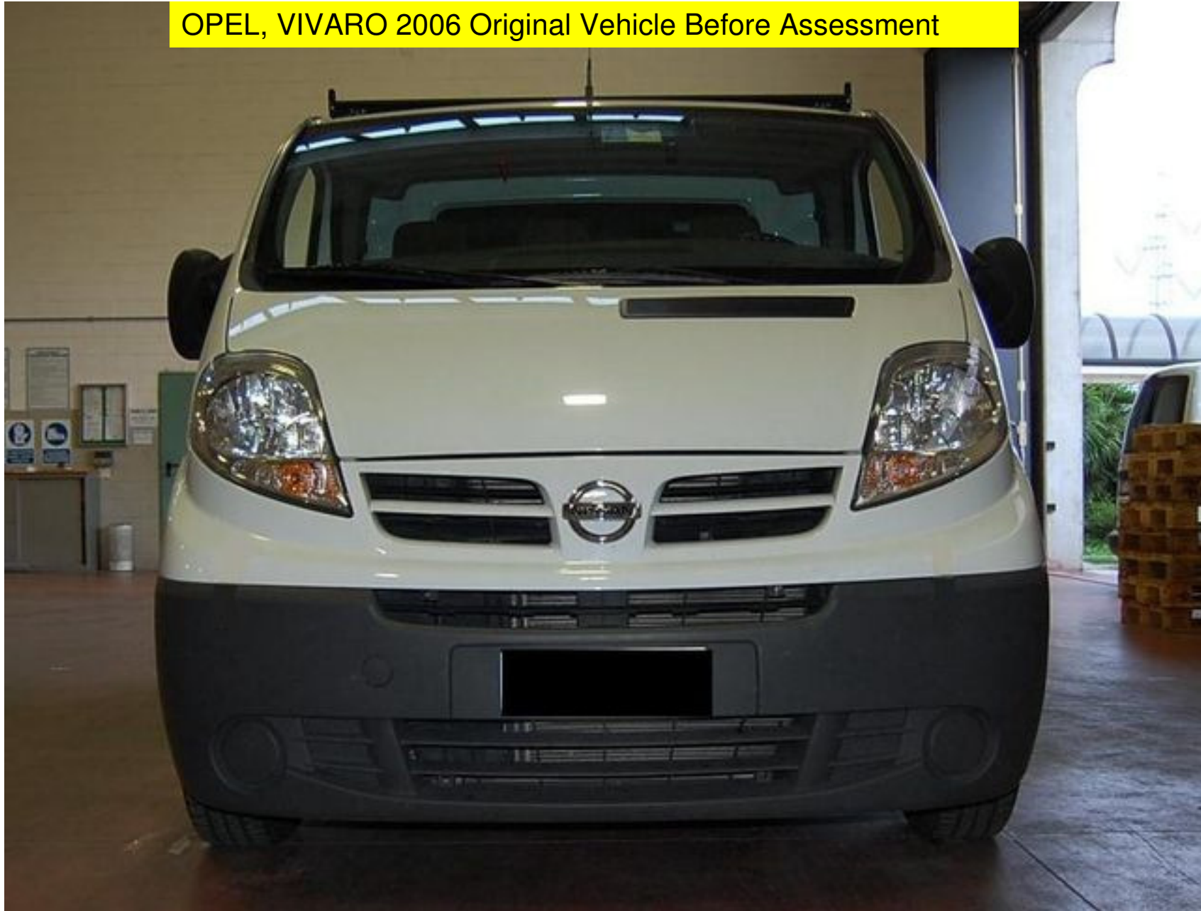
OPEL, VIVARO 2006 Original Vehicle Before Assessment