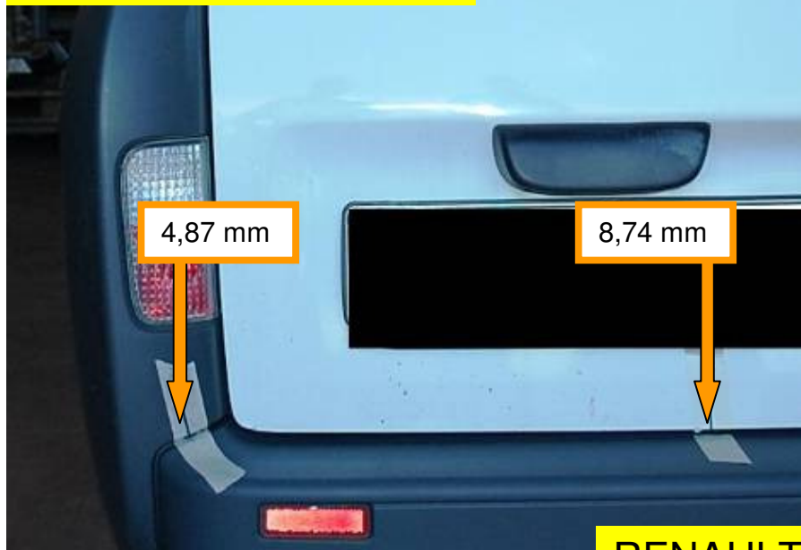
SPMP Rear Bumper L/H